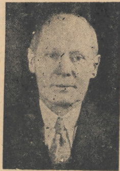
Pages Out of the Past No. 165

HELENS BEAUTY SALON Main St. Rosendale, N. Y.