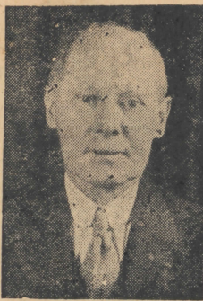
Pages Out of the Past N. 175*